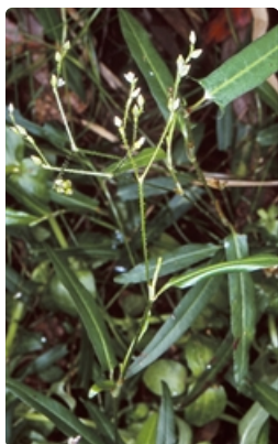
Flowering stems. Bodalla State Forest near Bodalla