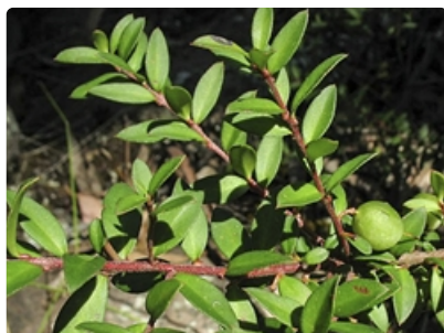
Leafy stems and fruit.