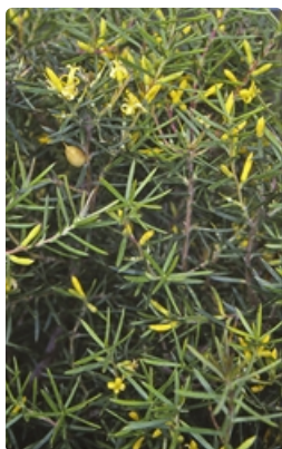
Flowering stems. Photographer Don Wood, Green Cape, Ben Boyd National Park south of Eden