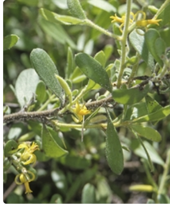
Flowering branches. Photographer Don Wood, Carnarvon Station Bush Heritage Reserve via Augathella, Qld