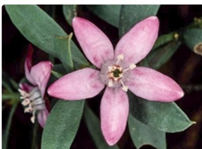
Flower and leaves (subsp. brevipedunculata ).