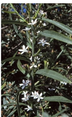
Flowering stem (subsp. myoporoides ). Photographer Don Wood, Eurobodalla Regional Botanic Gardens north of Moruya