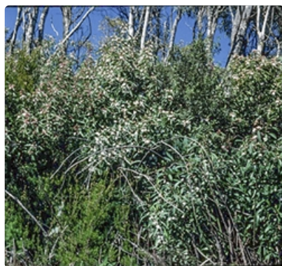
Shrub (subsp. myoporoides ).