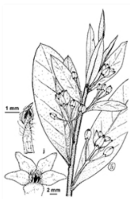
Line drawings. (subsp. myoporoides ). j. flowering branch; flower; stamen. T. Brosch, National Herbarium of Victoria, © 2021 Royal Botanic Gardens Board