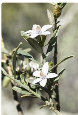
Flowering stem (subsp. acuta ). Manna State Forest near Condobolin