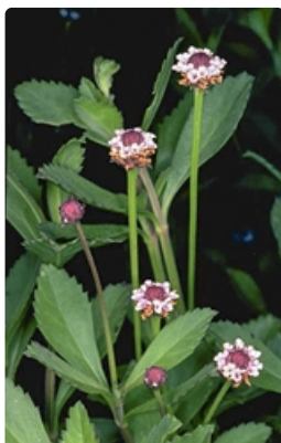
Flowers and leaves. near Forster