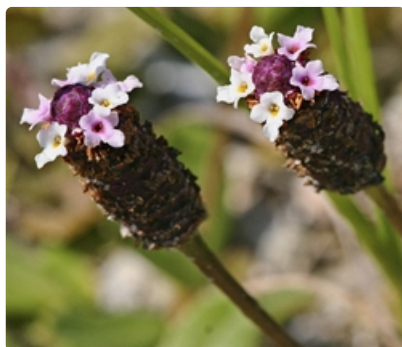
Flowers and leaves.