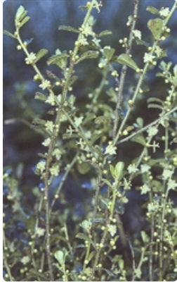
Flowering stems with male flowers. Photographer Don Wood, Bomaderry Creek Regional Park north of Nowra