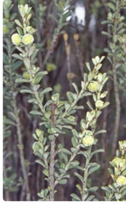
Fruiting stems. Photographer Don Wood, Black Mountain, Canberra, ACT