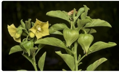
Flowering and fruiting stems. Australian Plant Image Index, photographer Murray Fagg, Black Mountain, Canberra, ACT