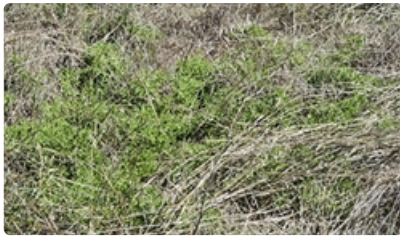
Plant. Australian Plant Image Index, photographer Murray Fagg, ACT