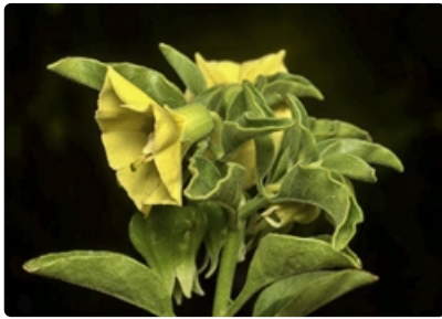
Flowering stem. Australian Plant Image Index, photographer Murray Fagg, Black Mountain, Canberra, ACT