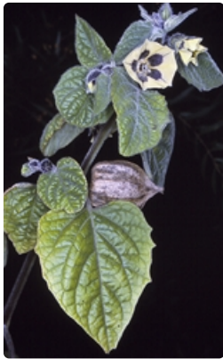
Flowers and leaves. Nadgee south of Eden