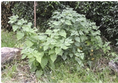
Plant.