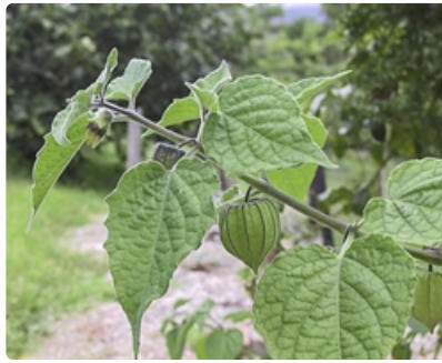
Stem with green fruits.