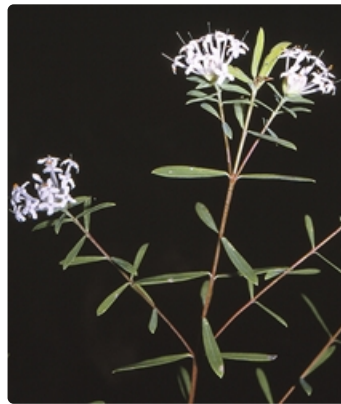
Flowering stems (subsp. linifolia ). between Huskisson and Tomerong, near Jervis Bay