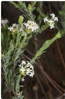
Flowering stems (subsp. collina ). west of Springsure, Qld