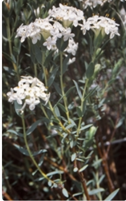
Flowering stems (subsp. caesia ). Namadji National Park, ACT