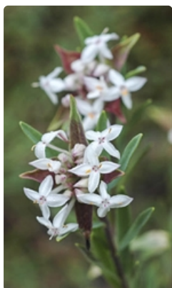
Flowering stems (subsp. linoides ).