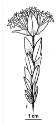
Line drawing (subsp. linifolia ), l flowering branch. M Mbir, National Herbarium of Victoria, © 2021 Royal Botanic Gardens Board