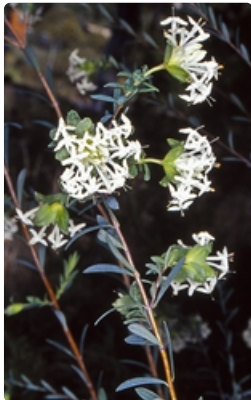
Flowering stems (subsp. linifolia ).