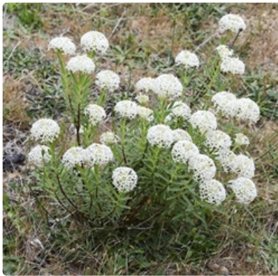
Flowering shrub. Corin Forest, ACT