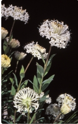
Flowering stems. Narradgi National Park, ACT