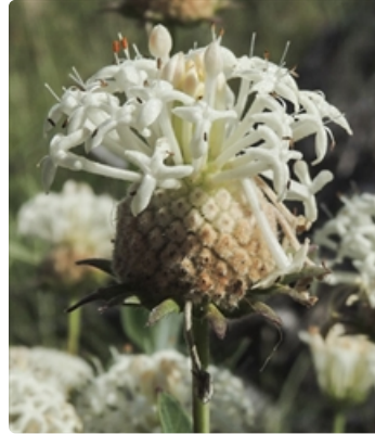
Flower head, some flowers spent, showing the dome shaped expanded top of the flower stalk. Photographer Michael Bedingfield, Narradgi National Park, ACT