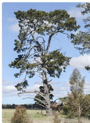
Tree. south of Goulburn