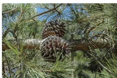
Open cones on tree.