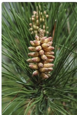
Male cones. Australian Plant Image Index, photographer Murray Fagg, Molonglo River, ACT