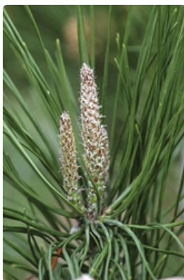
Female cones not yet pollinated. Molonglo River, ACT