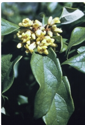
Flowering stem. Tathra Wildlife Reserve near Tathra