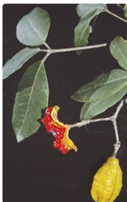
Seed cases and leafy stems. Bangalee Reserve near Nowra