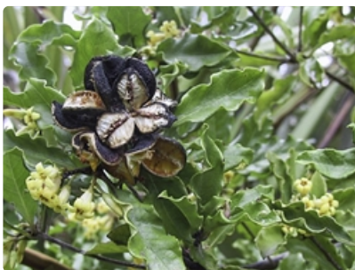
Old seed cases and flowering stems.