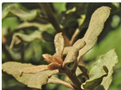
Young stems and leaves.