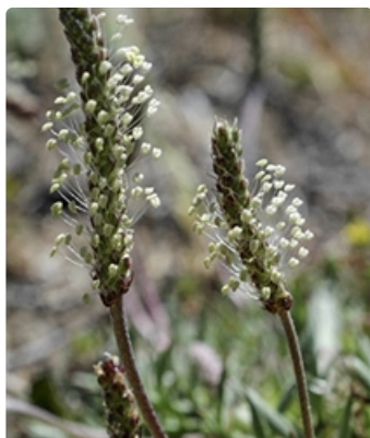
Flower heads (subsp. coronopus ). Lake George