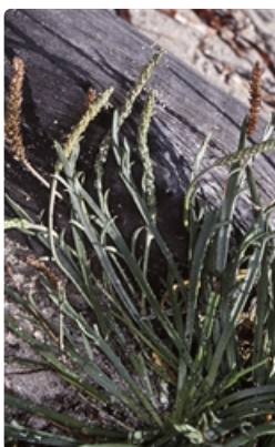
Plant (subsp. commutata ). near Merimbula