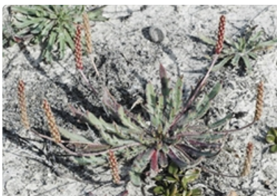
Plant (subsp. coronopus ). Lake George