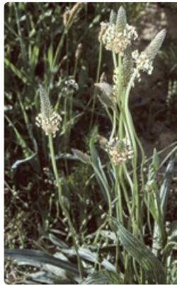
Flowering plant. near Candelo