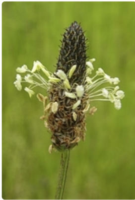
Flower head.