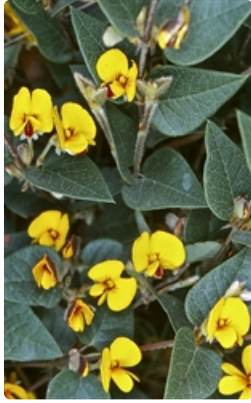
Flowering stems. Brindabella Range near Piccadilly Circus, NSW