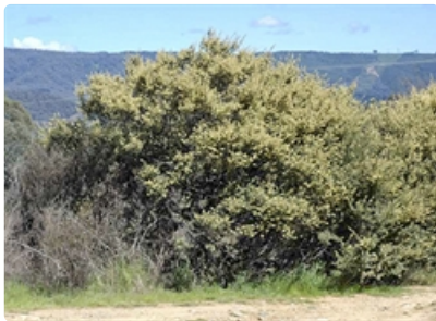
Shrub. Kosciuszko National Park