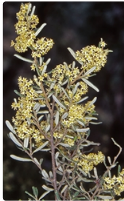
Flowering stem. Campbell Park, Canberra, ACT