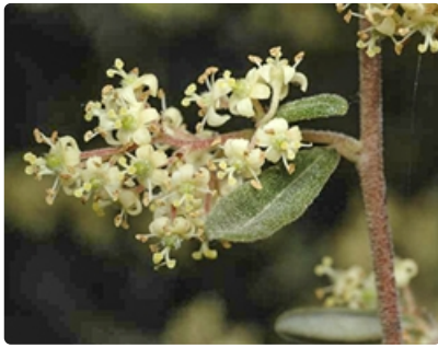
Flowering stem. Kosciuszko National Park