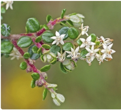
Flowering branch.