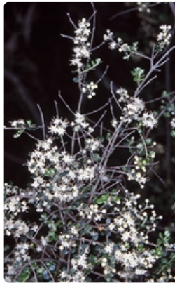
Flowering branches.