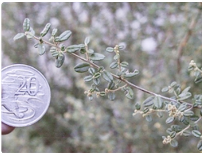
Stem with spent flowers.