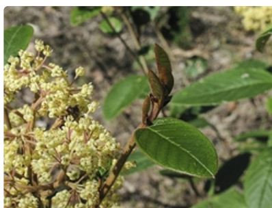
Leafy stem and flower cluster.