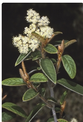
Flowering stems. Jervis Bay, NSW