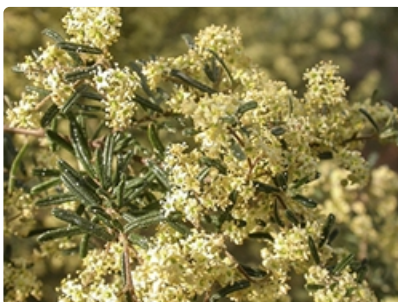
Flowering branches.