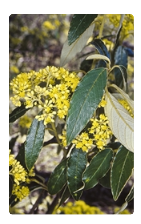
Flow ering stem. Photographer Don Wood, Black Mountain, Canberra, ACT