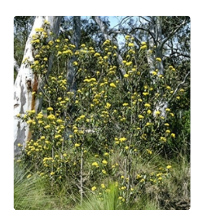
Shrubs. natural in Australian National Botanic Gardens, Canberra, ACT