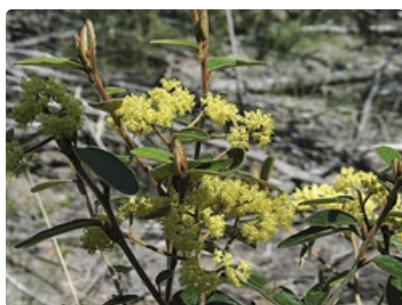
Flowering stems with young leaves.