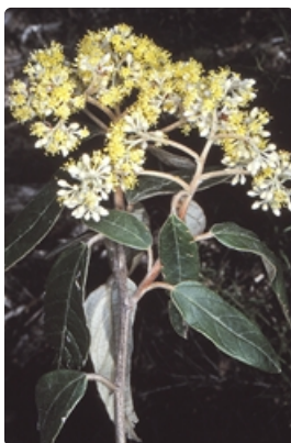
Flowering stem. Murrumbidgee State Forest south of Bermagui