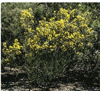
Flowering shrub.