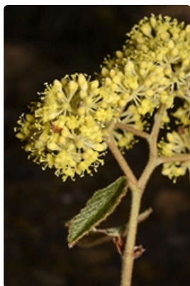
Flowering stem. Australian Plant Image Index, photographer Murray Fagg, Expedition Range National Park SE of Emerald, Qld