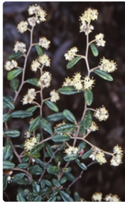
Flowering stems.