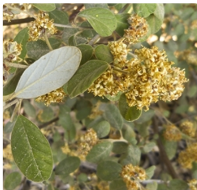
Flowering stem. Photographer Don Wood, Paddys River Road, ACT