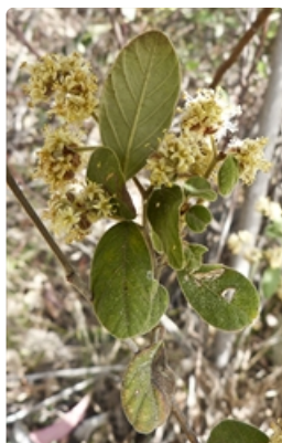
Flowering stem. Photographer Don Wood, Paddys River Road, ACT