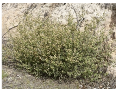
Flowering shrub. Paddys River Road, ACT