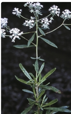
Flowering stem. Dampier State Forest west of Mbruya