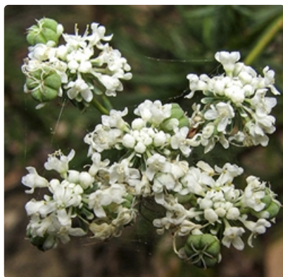
Flower clusters. Photographer Richard Hartland, unknown site