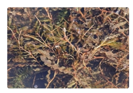
Flowering plant.