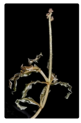
Leafy stemwith flowers. Australian Plant Image Index, photographer Kevin Thiele, WA