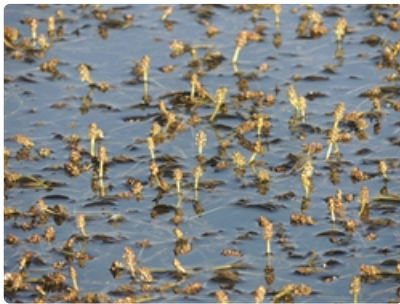
Flowering plants. dam east of the Murrumbidgee River, ACT