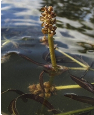
Flower spike.