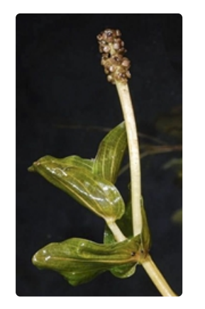
Flow ering stem