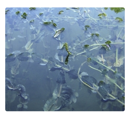
Plants. unknown place