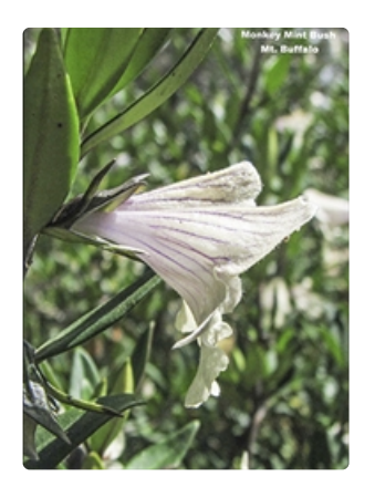
Flower and leaves. Mt Buffalo, Vic