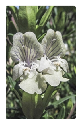
Flowers and leaves. Mt Buffalo, Vic