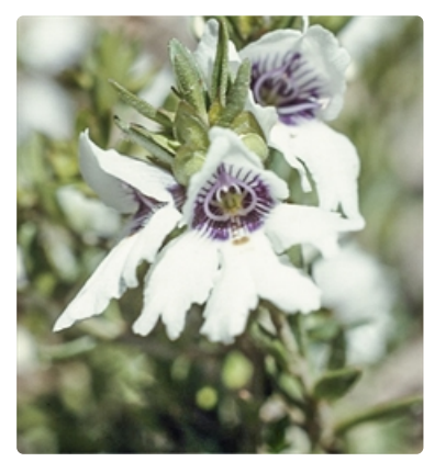
Flowers (var. montana ).