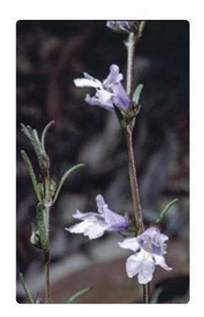
Rowering stem and leafy stem (var. bracteolata ).