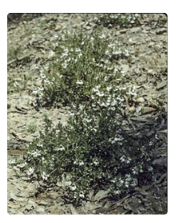
Shrub (var. montana ).