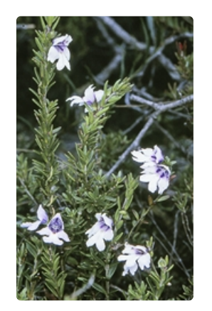
Flow ering branches (var. montana ). Morton National Park