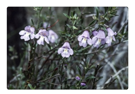
Flowering stems (var. bracteolata ).