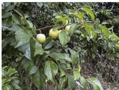
Leafy stems with fruit.