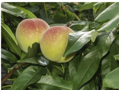
Peaches and leaves. Photographer Lucien Monfils, unknown place