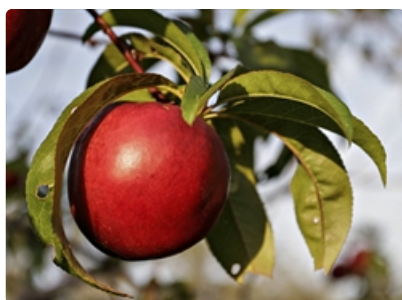
Nectarine on leafy stem.