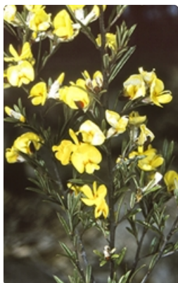
Flowering branch. Nullica State Forest west of Eden