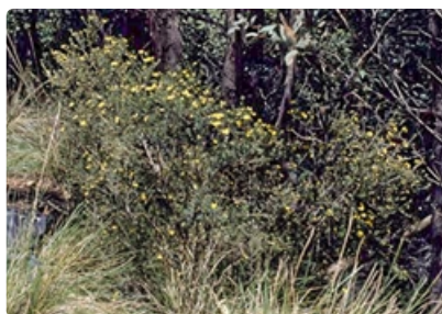
Shrub. Australian Plant Image Index, photographer Rogier de Kok, Grampians, Vic