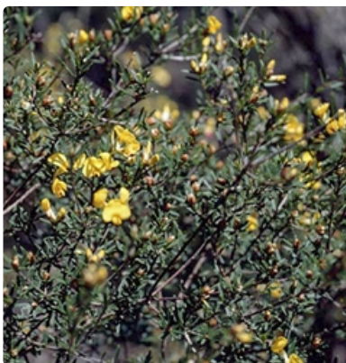
Flowering branches. Australian Plant Image Index, photographer Rogier de Kok, Grampians, Vic