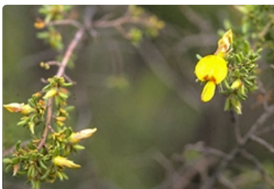
Flowering branches. Australian Plant Image Index, photographer Rogier de Kok, Grampians, Vic