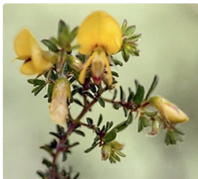
Flowering stem. Grampians, Vic