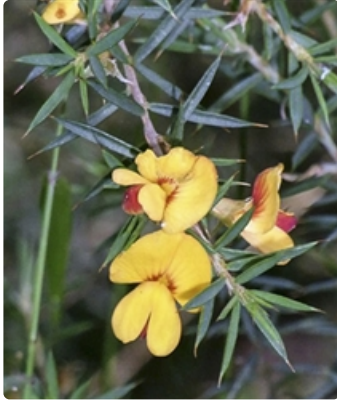
Flowering stem. Photographer Russell Best, Macedon Ranges, Vic