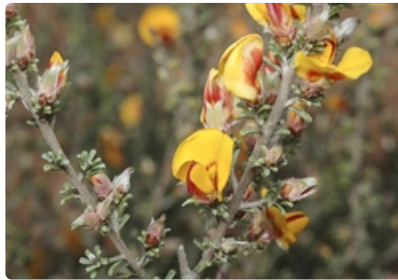
Flowering branches. near West Wyalong