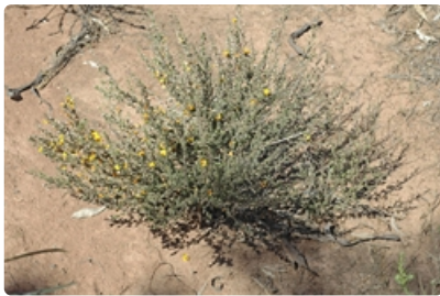
Shrub. near West Wyalong