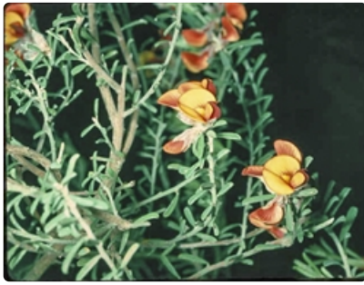
Flowering branches.