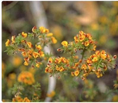
Flowering stems. Lotia Conservation Park, Adelaide, SA