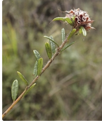
Stem with pods.