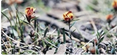
Flowering stems. unknown site