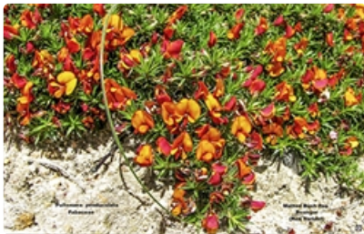
Shrub.