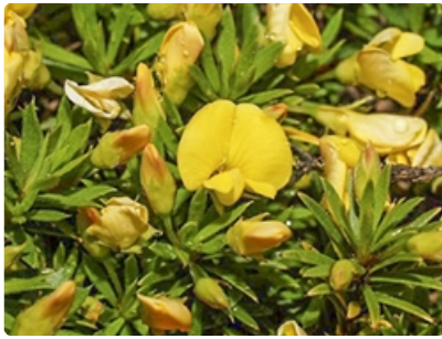
Flowers and leaves. Grampians National Park, Vic