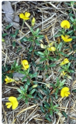
Flowering shrub. Photographer Don Wood, Bournda National Park south of Tathra