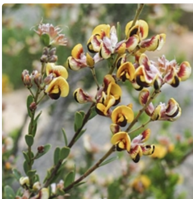
Flowering stems. Burrowa-Pine Mountain National Park, Vic.