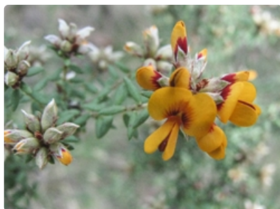
Flowering stem. Photographer Arthur Chapman, near Ballarat, Vic