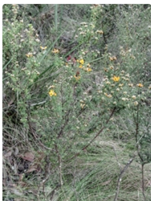
Shrub. near Ballarat, Vic