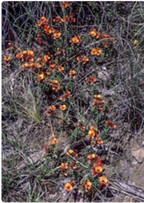
Shrub. Mongarlowe, east of Braidwood