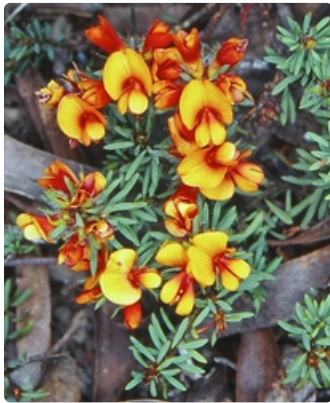
Flowering stems. east of Braidwood