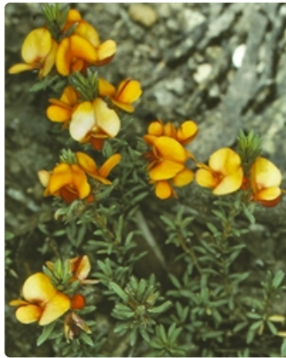
Flowering stems. Wadbilliga National Park