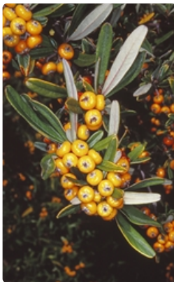
Fruiting stem. near Cotter Bridge, ACT