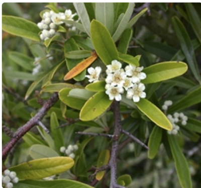
Flowering stem. Australian Plant Image Index, photographers RG & FJ Richardson, garden, Woorndoo, Vic