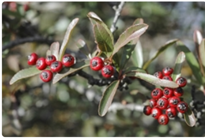
Fruiting stem.