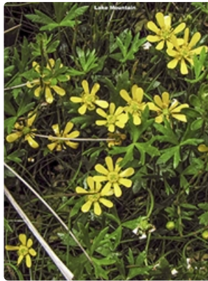
Flowers and leaves. Lake Mountain, Vic