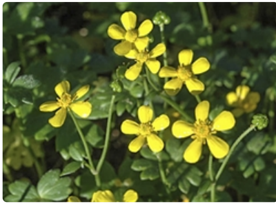
Flowering stems. Australian Plant Image Index, photographer Murray Fagg, Australian National Botanic Gardens, Canberra, ACT