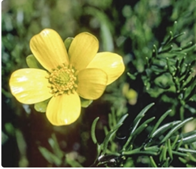
Flower and leaf. Australian Plant Image Index, photographer Murray Fagg, Kosciuszko National Park