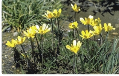
Flowering plants. Kosciuszko National Park