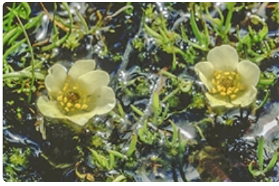
Flowering plants. Australian Plant Image Index, photographer Murray Fagg, Kosciuszko National Park