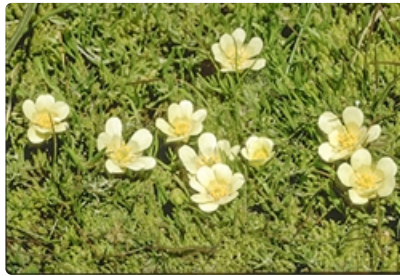
Flowering plants. Kosciuszko National Park