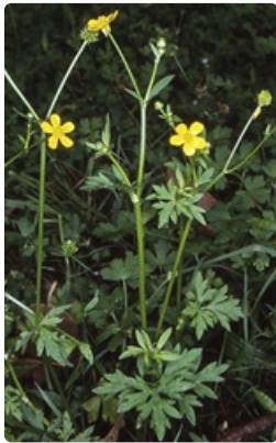
Flowering stems. Bangalee Reserve near Nowra