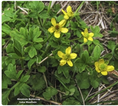
Flowers and leaves. Lake Mountain, Vic