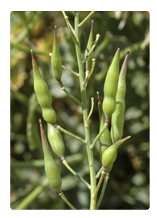
Seed cases. Australian Plant Image Index, photographer Murray Fagg, Hoskinstow n