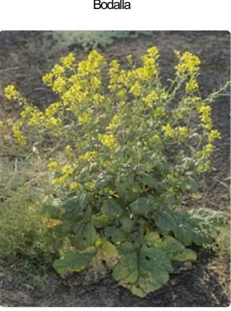
Rowering plant. east of Hay