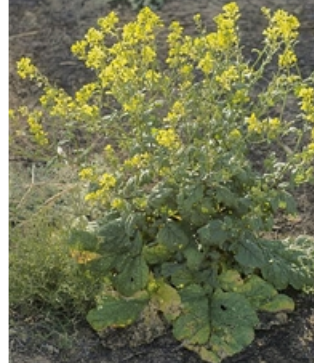
Flow ering stems. Photographer Don Wood, west of Bodalla