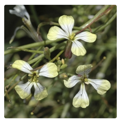
Flowers. Australian Flant Image Index, photographer Murray Fagg, Hoskinstown