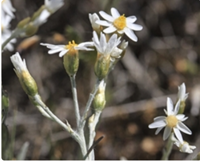
Flowering stems.