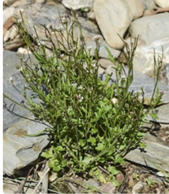
Flowering plant. Australian Plant Image Index, photographer Murray Fagg, near Captains Flat