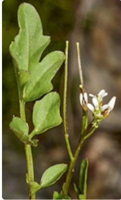
Flowers, young 'pods', and leaf. Australian Plant Image Index, photographer Murray Fagg, near Captains Flat