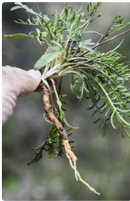
Uprooted plant. Australian Plant Image Index, photographer Murray Fagg, near Captains Flat